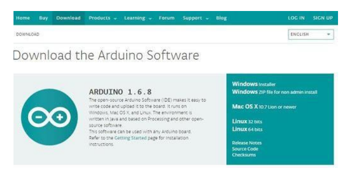
Fig.2.Arduino IDE Software [16]

International Journal of Modern Agriculture, Volume 10, No.2, 2021 ISSN: 2305-7246