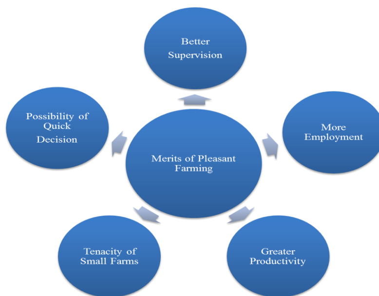
Figure 1: Schematic Representation of Advantages of Peasant Farming

Every farming system in the agriculture sector has advantages as well as disadvantages on the other side when it is compared to the other farming systems. (Shown in Figure 1).