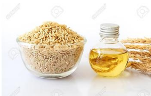
Figure 1. Rice Bran Oil

time, edible oil brands ' health claims are a dozen times higher and can confuse the customer as to how best to buy. Rice (fiber) bran lubricant/oil is revealed in Fig. 1.[3]