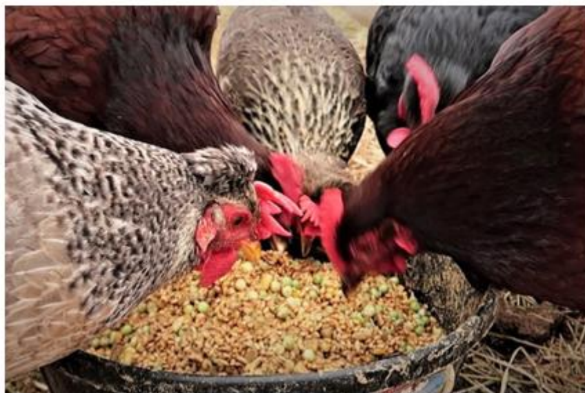
Figure 3. Rice Bran Used for poultry Farm

There have, however, been limited studies on certain smidgen minerals. The traditionally overlooked minerals, which are usually sufficient or only slightly inadequate in practical diets. Biological obtain-ability in realistic diets will make the requirements for certain of these minerals vary. With respect to manganese, some of the additives have been displayed to minimize their inorganic supply. [6]