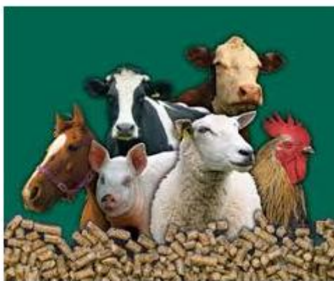
Figure 2. Rice Bran for different Animals

Rice (fiber) bran has 12-15 percent protein and is one of the most attractive and plentiful milling by-products with a good extremely poorly-balanced amino acid supply. The reduction in quality & quantity of protein will increase as well as the availability of numerous nutrients, taking into account the prohibition of rice. During fermentation, a quantity of enzymes such as alpha-amylase, \alpha -ACETOLACTATE, decarboxylase, \beta -ENDOGLUKANASE, HEMICELLULASE, PHYTASE, MALTOGENIC amylase, & xylanase produce inoculum microbial fermentations, which have capability to damage fiber. Rice bran may be employed for many domestic animals as demonstrated in Fig. 2.[4]