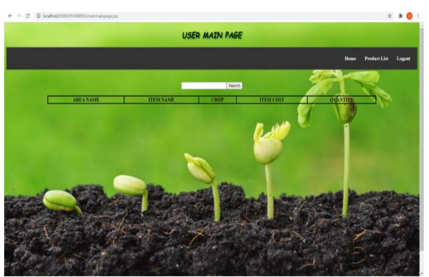
Fig 8. USER MAIN PAGE