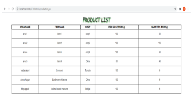
Fig 6. PRODUCT LIST BY ADMIN