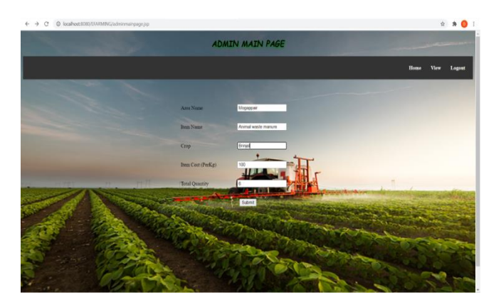
Fig 5.DATA UPLOAD BY ADMIN