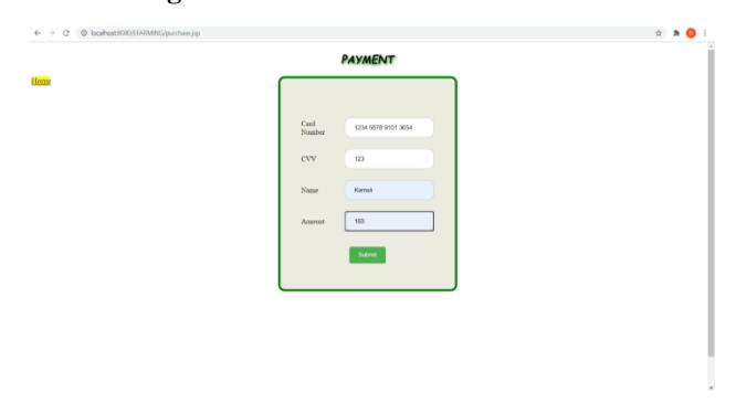
Fig 11.PAYMENT BY USER