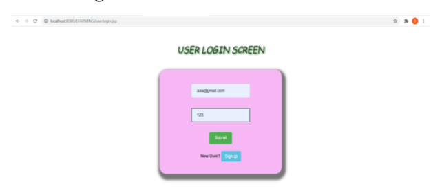
Fig 7. CUSTOMER LOGIN