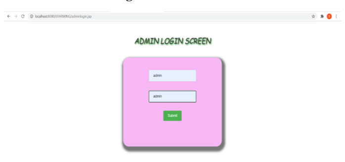
Fig 3. ADMIN LOGIN PAGE