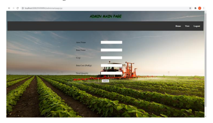
Fig 4. ADMIN MAIN PAGE