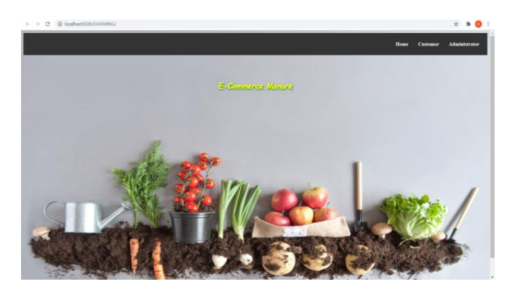
Fig 2. HOME PAGE