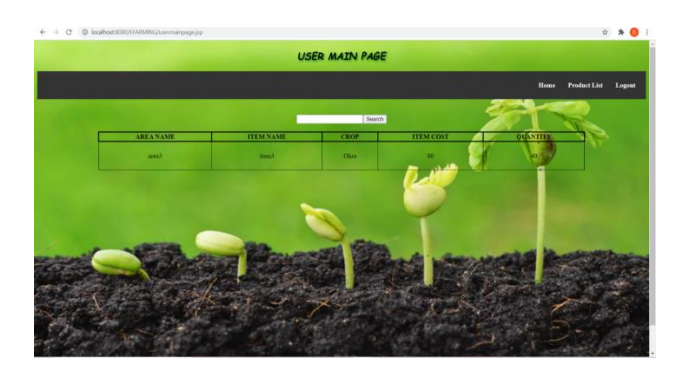
Fig 9.PRODUCT SEARCH BY USER