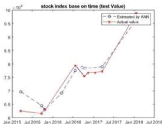
Figure 1- Model output

In the second model, with the entry of macroeconomic variables and the stock index during 2017-2014, after testing the estimated index model by the network with the model design, the number of hidden layers is 2, 70 neurons and 6 estimated inputs. Thus, we achieved the main goal of the research. Statistical coefficients R and R^2 as well as the characteristics of the feed neural network are shown in Table 2.