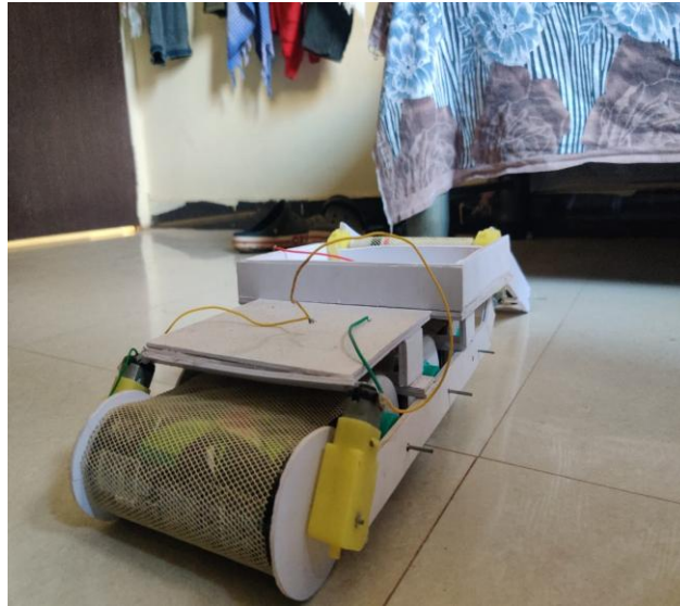
Fig. 3. Proposed Model for the project