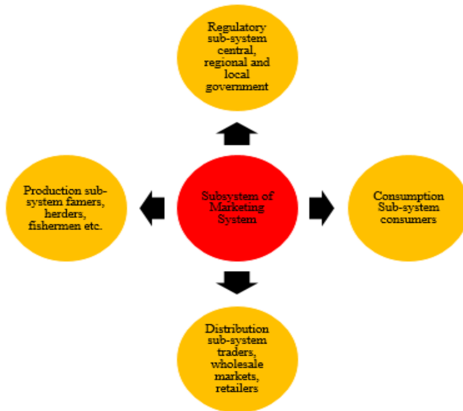
Figure 2: Subsystem of Marketing System is divided into Four Parts which are Production, Distribution, Consumption and Regulatory.

Agricultural marketing's refers to the resources that go into getting a crop from farm to customer. These facilities include preparing, arranging, directing, and treating agricultural products in such manner that growers, customers, and intermediaries are satisfied. Planning productions, harvesting and growing, grading, loading and shipping, transport, transportation, agro and food manufacturing, consumer knowledge, delivery, advertisement, and selling are only a few of the intertwined operations involved. The concept effectively encompasses entire spectrum of agricultural product supply chains activities, whether performed by ad hoc sales or a more integrated chain, like one involving farming[4]. Agricultural marketing's encompasses all operations relating to procurement, , grading, collection, storage, agro-processing and food, distribution, funding, and sale of agricultural inputs and outputs. In fact, marketing covers all facets of agribusiness, but it lacks agriculture as a central activity. Agricultural marketing mechanisms are also linked to agricultural area economic development and maintaining nutritious and sustainable food for customers, all of which are directly linked to the country's food security[5].