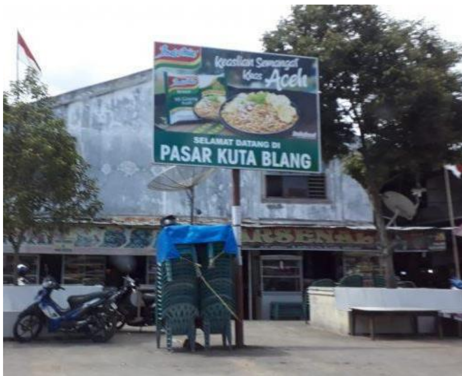
Figure 1: Kuta Blang District Market, (joint market of several villages including Lhok Nga) (Photo taken by Junaedi, 2020)

This verse made the people of Lhok Nga village at that time put their trust in Allah. Step by step is carried out and passed so that the absence of work causes the community to carry out erratic activities, including planting the yard and back of the house with secondary crops such as chilies, eggplant, cassava, and several other types of young plants. This activity becomes routine until it becomes a culture. This trip has changed some of the cultures of the people who used to work outside to work at home, including those who used to depend on the market, now people only use the market as support because other needs have been met. This is one of the sweet fruits of the past conflict of the Republic of Indonesia, the Free Aceh Movement (GAM), the economic independence of the people of Lhok Nga Village with the presence of various plants around the house that can be consumed (Interview, 27 September 2020).